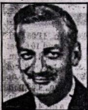
1968 file photo